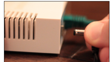
Step 5b — Rebooting Router